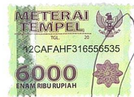
Nur 'Aini Afifah