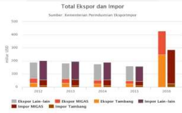
Figure 1 Total Indonesian Exports and Imports in 2012-2016